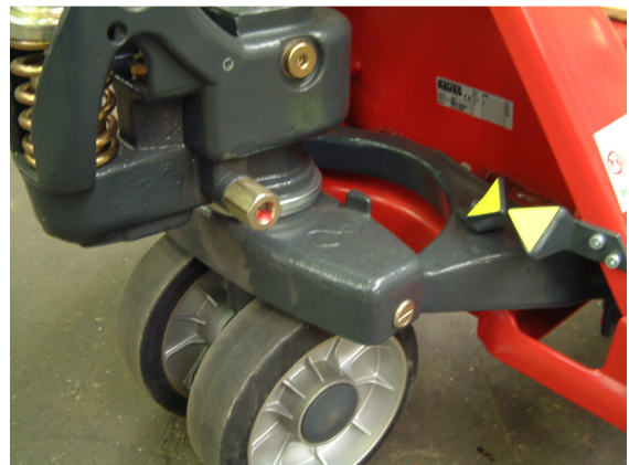
Weighing at reference height only